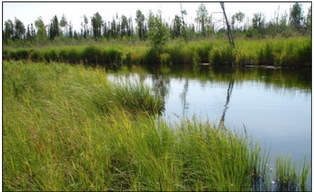
Water temperature monitoring site is located below the Beaver Lakes Road crossing.

Cook Inletkeeper coordinates a Stream Temperature Monitoring Network across key salmon-bearing systems of the Cook Inlet basin. Our goal is to describe water temperature profiles and identify watershed characteristics that make specific streams more sensitive to climate change impacts. This fact sheet provides a summary of data collected on Meadow Creek through this collaborative effort.