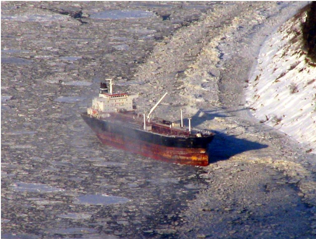
Attachment 2 Seabulk Pride Grounding, Feb. 2, 2006